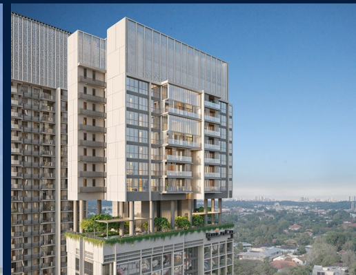
Sereen : 2 - Bedroom